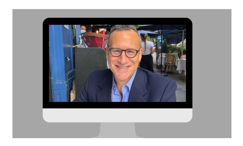
Stay Connected With Us!