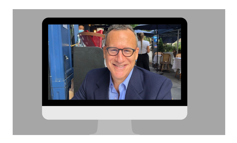
Stay Connected With Us!